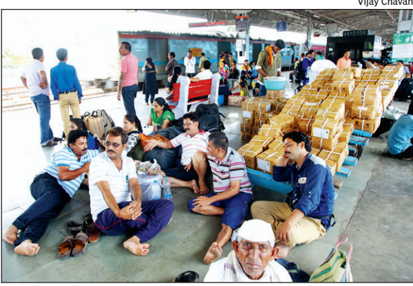
The officials, however, said that the opening of track was delayed by several hours

Abhilash.Botekar @timesgroup.com Nashik: The Railways heaved a sigh of relief on Saturday as the second line — towards Mumbai from Bhusawal (Up) — that was under repair at the spot where the Duronto Express derailed on Tuesday was opened for traffic. Now, all commuter trains from Manmad are expected to run normally from Monday. The track between Asangaon and Vasind in Mumbai Division of Central Railway was damaged after derailment of Nagpur-Mumbai Duronto Express.