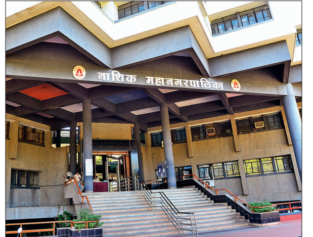
The building permission is supposed to be accorded within a period of 60 days

Nashik: Out of the total 138 proposals for building plan approval uploaded on Auto DCR (automating development control regulation) from June 1, only seven have been approved till date. In addition, a total of 11 proposals show shortfall owing to various reasons. The building permission is supposed to be accorded within a period of 60 days. On being asked about this, the Nashik Municipal Corporation (NMC) officials said that they will check the pendency period and will speed up the approval process. According to sources in the NMC's town planning department, 16 of their computers are lying defunct and only four are working. Architects, engineers and builders are disappointed with the system as none of the 138 proposals have been rejected and the number of approvals has been dismal. The Auto DCR was brought into force on June 1 to bring about transparency, reduce work of the town planning department and prevent human errors. A renowned architect in the city told TOI, on condition of anonymity, said, "The Auto DCR was to be implemented 5-6 years ago. The Central government had asked corporations to do it under JNNURM, but there was a lot of political interference. Now they launched it in a hurry. The system